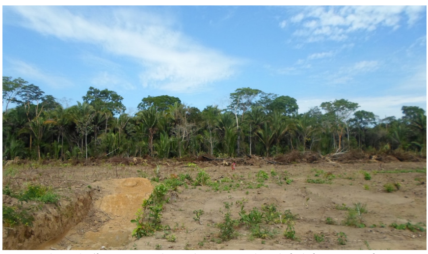
Forestry-based offset projects have the potential to shift deforestation from the project location to unprotected areas causing project leakage to occur.

Finally, to control for all these possible causes of overestimation, it is important to monitor and verify a project's performance.<sup>30</sup> It is important for measurement and data collection procedures – and for any calculations or estimates derived from these data – to be scientifically sound and methodologically robust. Furthermore, it is important for project monitoring data to be rigorously verified. Verification entails assessing the veracity of data provided by project developers, often through an audit of selected data samples. Carbon offset project developers have an incentive to report data that maximize the number of carbon offset credits they can sell. Verification helps to assure that reported data are accurate and do not overstate GHG emission reductions.