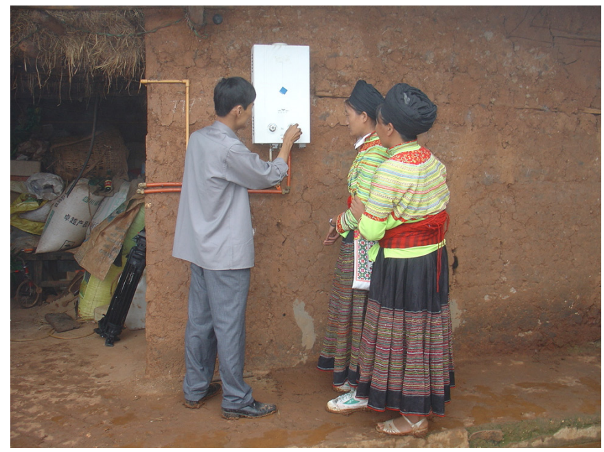
Villagers learn how to use bio-gas as a fuel source for cooking supplied by small-scale anaerobic digesters.

More detail on how carbon offset programs seek to ensure the quality of offset credits (along with some of their limitations) can be found in Section 4 of this guide.