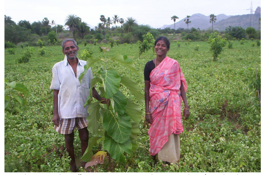
Tree planting carbon offset projects can provide many co-benefits to local communities.

below, we highlight some questions that buyers can ask about specific offset projects to better ascertain their relative quality. Even for sophisticated buyers, however, getting detailed answers to these questions may be difficult. Thus, in Section 5, we identify a range of strategies buyers can use to steer clear of lower quality offset credits and improve the chances of acquiring higher-quality credits.