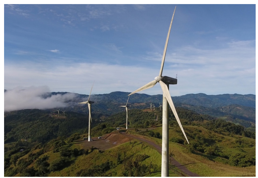
Renewable energy carbon offset projects like this wind farm, must be highly scrutinized for their additionality and the role of potential offset revenue incentivizing the project to occur.

Carbon offset programs have developed two main approaches to determining the additionality of a project: "project-specific" and "standardized." Each of these approaches has strengths and weaknesses.