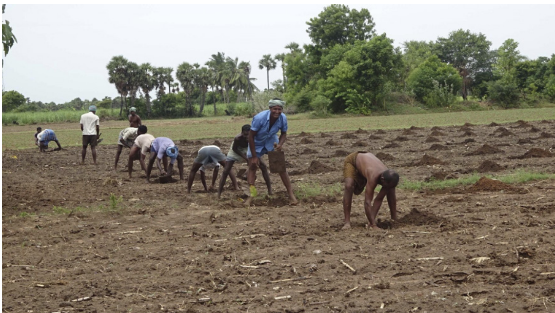
Agriculture-based carbon offset projects can create job opportunities through increased management intensity.