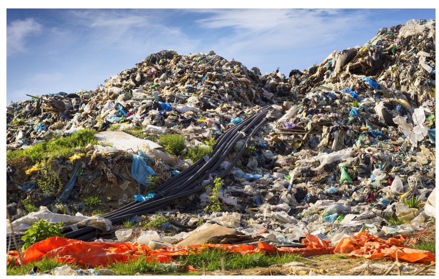
Sometimes GHG reduction activities are required by law. Landfill operators in California, for instance, are required to install equipment that captures and destroys methane.

based on the prospect of carbon offset sales – they may pose a higher risk of being non-additional.