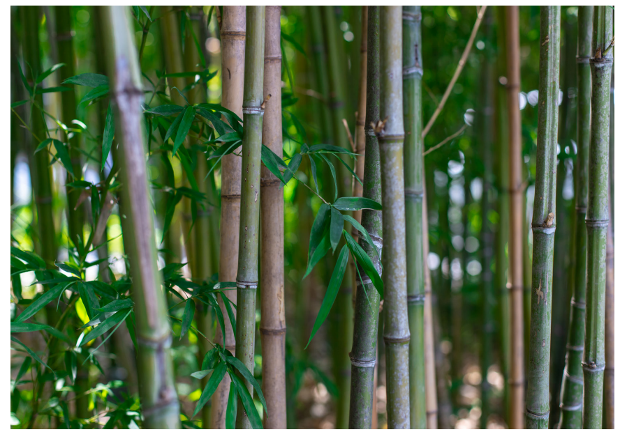
Some species, such as bamboo, may rapidly sequester carbon, but planting non-native or invasive species of plants can lead to damaging outcomes.

These critiques are troubling and should give pause to prospective buyers of offset credits. Major carbon offset programs, however, have responded to at least some of the concerns raised by these studies. These responses include amending quantification methodologies to prevent over-estimation of GHG reductions, <sup>20</sup>